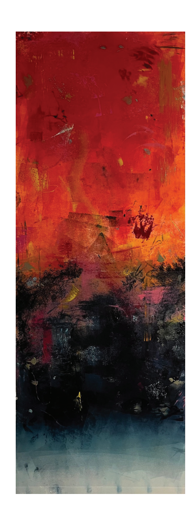
RACHEL ALDERTON In Love to Indifference - 2 Monotype