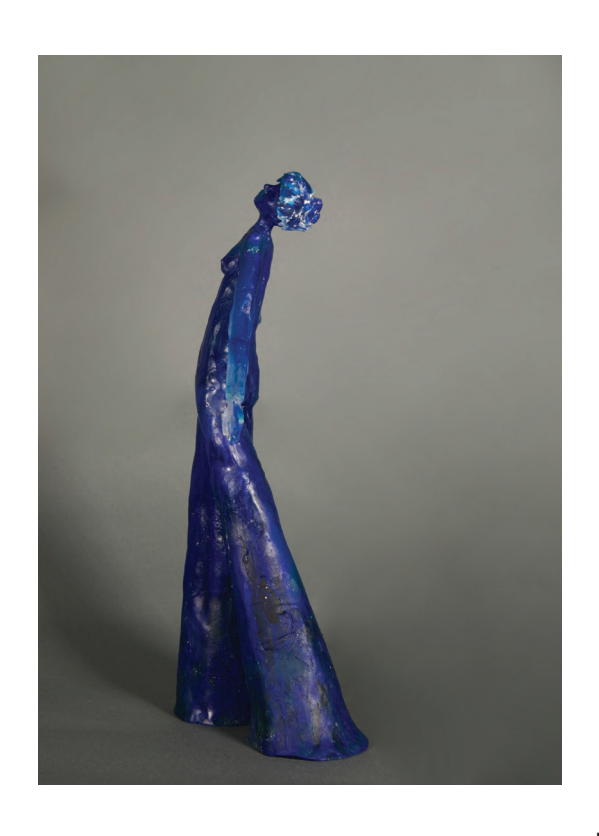
LEAH HENSELER Troubled Waters Cast Glass