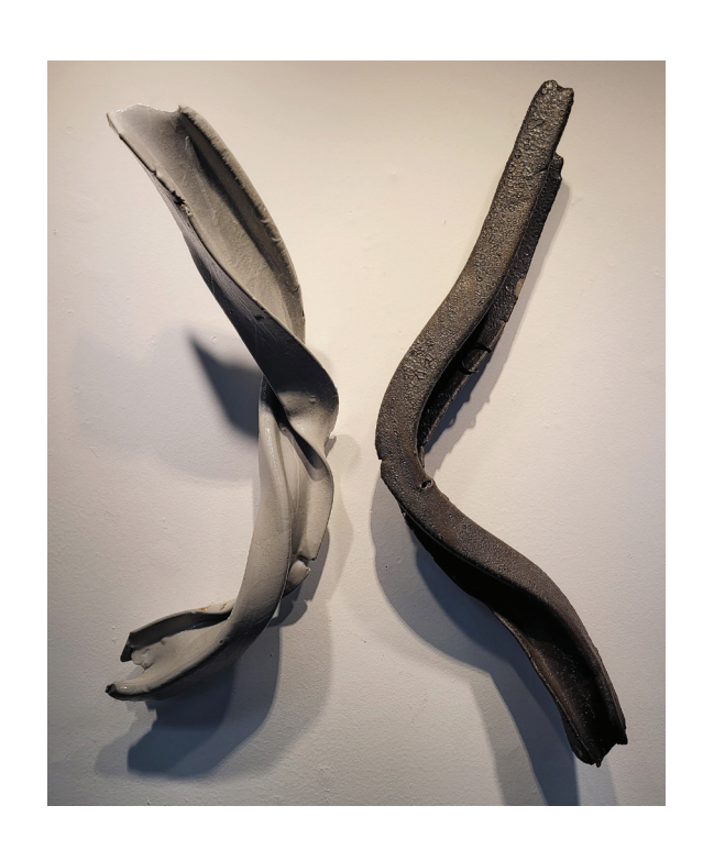
ANTHONY MAGNETTI Untitled (Side by Side) Ceramic